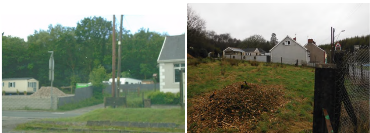
Figure 5 – Relationship of application site with Fountain Cottage

N.B. The static mobile home located to the west of the site is sited in the approved location.