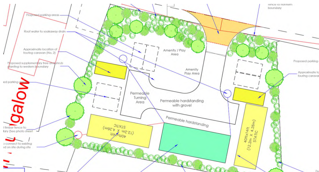
Figure 2 - Proposed Site Layout:

The proposal involves the provision of a larger building than approved which would provide separate facilities for the two families. Each of the units would have internal dimensions of 6.1 metres x 4.8 metres with the building having overall external dimensions of 13.5 metres x 5.8 metres (giving a total floor area of approximately 60 square metres). Heights to eaves and ridge heights would be 2.4 metres and 4 metres respectively.