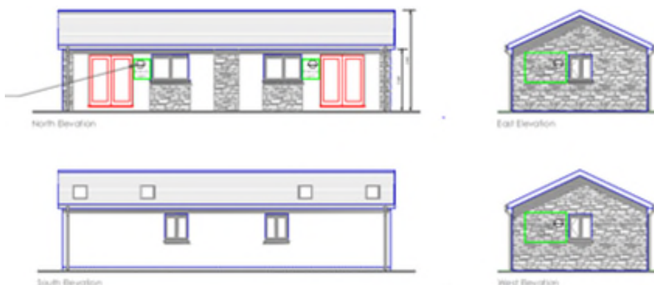
Figure 3 – Proposed Elevations

The building will be finished with a pitched black/blue natural slate roof and the external walls will be a mixture of rendered blockwork and stone, the stone being predominant on