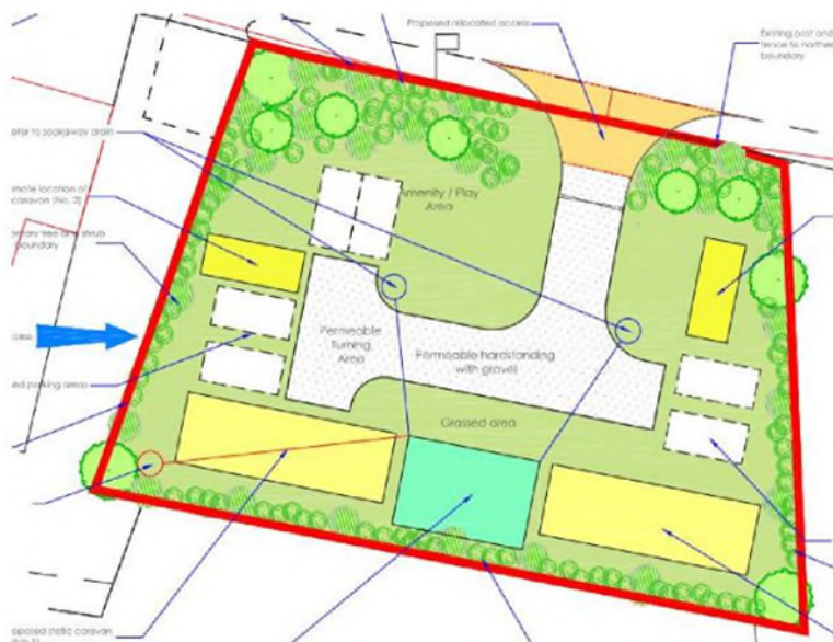
Figure 1 – Approved Site Layout under P/17/891/FUL

The application now proposes a larger utility/day room building which has separate facilities to serve two separate families living on the site rather than a shared unit. The two families comprise 4 adults and 7 children. The application also proposes a revised site layout as a result of the proposed change to the amenity building.